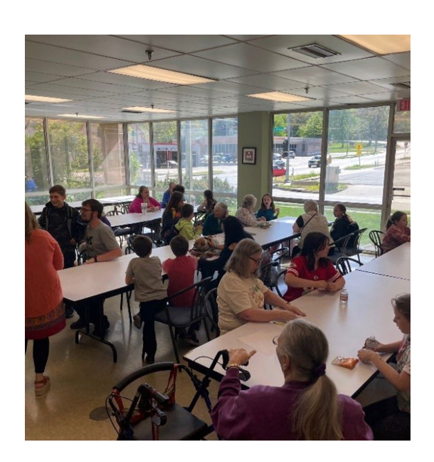
Residents of Colony Plaza enjoy meeting their pen pals at the local elementary school.

At Colony Plaza Apartments in Excelsior Springs, MO, senior residents enjoy a pen pal program with 5th graders at a local elementary school. At the end of the school year, residents and students have an opportunity to meet and celebrate in person. At Lafayette Terrace in Chicago, IL, POAH partners with Oak Street Health to host isolation intervention and wellness programs for residents each month. Through dancing, luncheons and Medicare Open enrollment, residents can connect with one another and with preventative healthcare services.