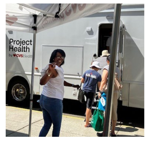
The CVS Mobile van stops at POAH's Massachusetts properties to offer on-site preventative health screenings to residents at no cost.

In Boston, MA POAH partners with <u>Boston</u> <u>Senior Home Care (BSHC)</u> to deliver a range of health programming and services from food bank coordination to hospitalization-home transitions, options counseling and beyond. At the Blackstone <u>Apartments</u>, a senior community in Boston, a longtime resident began showing signs of distress in their