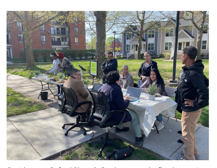
Residents at Oxford Place & Gardens attend a floral arranging workshop and sign up for free WiFi - all in one!

networks at Salem Heights Apartments in Salem, MA and Oxford Place & Gardens in Providence, RI, reaching more than 300 residents with free WiFi. We have ambitious plans to expand affordable broadband networks at locations throughout our portfolio, ensuring that residents of affordable multifamily housing communities have equal access to the internet and full participation in our online society.